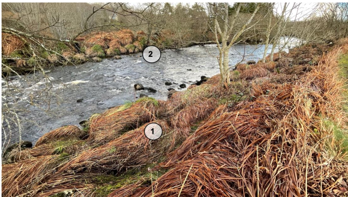
Figure 2: Montbretia forming extensive large clumps/corms and channels on the near (1) and far (2) banks of the river