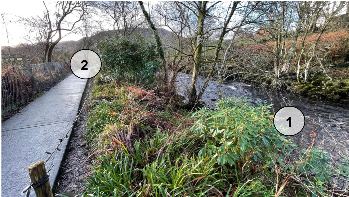
Figure 7: Further growth of Rhododendron at the right foreground (1) and background (2).