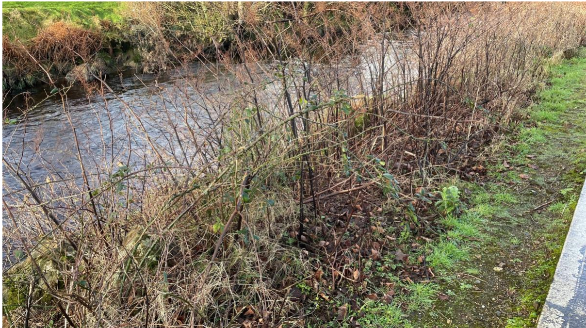
Figure 4: Withered stems of Japanese Knotweed along the riverban