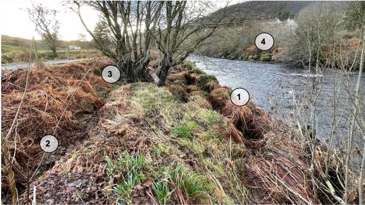
Figure 3: Damage to the riverbank with weakening of a large section of bank adjacent to the river (1) and loss of integrity of the higher bank (2) leading to exposure and weakening of the tree roots (3) caused by Montbretia. Stands of Montbretia are clearly visible also on the far side of the river (4).