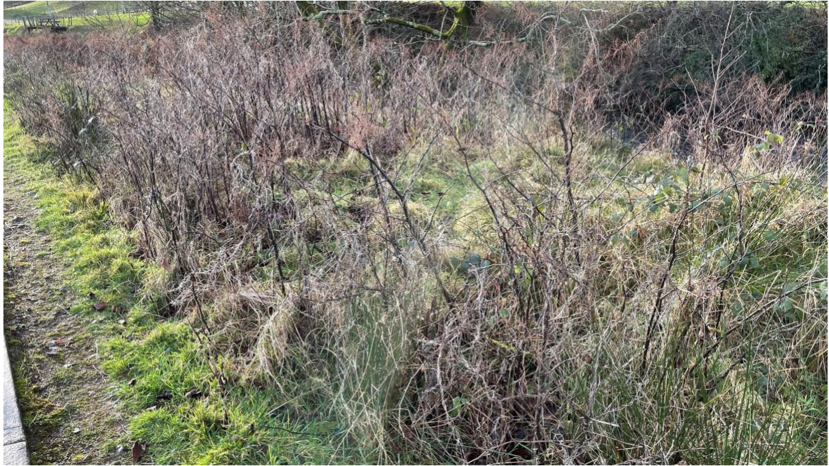
Figure 5: More Japanese knotweed alongside the river. This is spreading below the walkway into adjacent meadows.