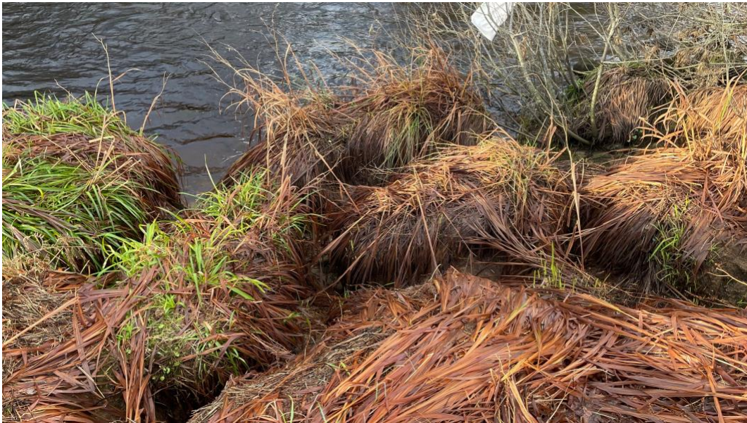
Figure 1: Stands/corms of Montbretia becoming detached from the riverbank.

Carrick Development Committee, Coiste Forbartha na Carraige, have an ambitious programme of development for the village, which seeks to improve the amenities open to people, both local and visitors. One particularly successful initiative, as testified by the large number of users and very positive feedback to the committee, has been the walkway along the banks of the Glen River. Recently, the impact of invasive alien species along the walkway has become a concern, due to the visible weakening of the river banks with associated loss of material into the river due to erosion, and consequential deterioration in water quality and the overall river channel integrity. These IAPS include Montbretia, Japanese Knotweed and Rhododendron (see photos).