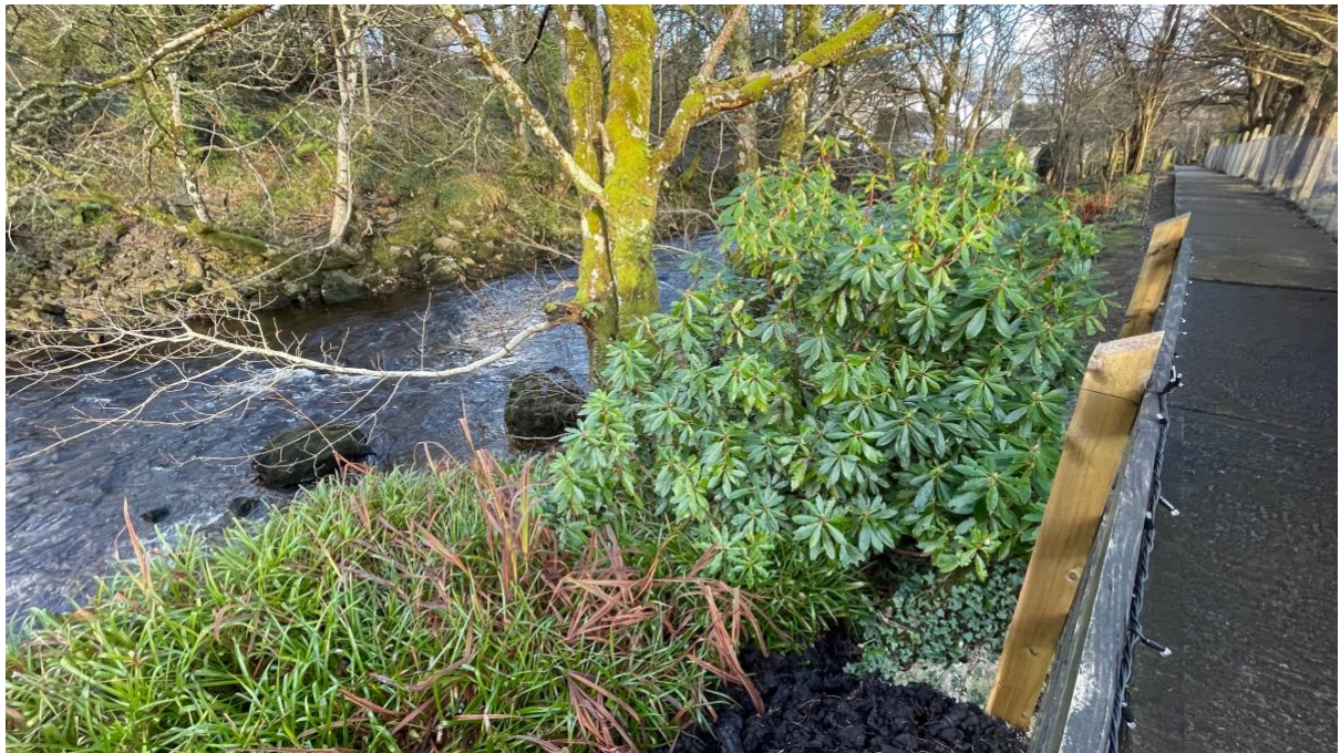
Figure 6: Rhododendron growing on the river bank.